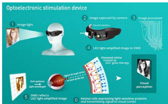
Blind patients suffering from retinitis pigmentosa may benefit from an optogenetic technique now in clinical trials.