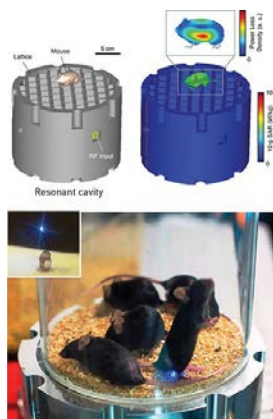
A resonant cavity (top) powers the wireless optogenetic platform developed by Ada Poon and colleagues at Stanford, using commercially available components. Wirelessly powered internal implants (inset, bottom) enable the mouse to move freely and behave normally while receiving optogenetic stimulation of peripheral nerve endings in the hind paw.

metal structure with a honeycomb top plate on which the mouse stands. When excited by an RF source at a specific resonance frequency, the cavity confines electromagnetic fields inside it. The honeycomb metal plate acts as an energy transfer mechanism, so that everywhere a mouse steps on the honeycomb, the energy flows through the mouse's body to reach the tiny receiving coil in the implanted LED device. The subcutaneous implant activates targeted clusters of neurons, which allows self-tracking of optogenetically stimulated mice safely and efficiently.