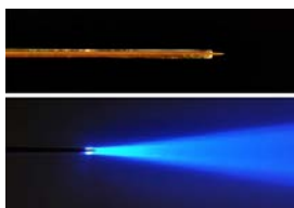
An optrode (an optical fiber glued to an electrode for measuring electrical activity of illuminated neurons) features a tapered electrode ending (top) for minimal tissue damage in larger brains of nonhuman primates during optogenetic stimulation. When switched on (bottom), the optrode emits a narrower, targeted cone of blue light.

Many unanswered questions remain about Parkinson's, casting doubt on whether a therapeutic application of optogenetics is likely in the near future. However, Galvan hopes to use optogenetics to further explore brain circuits, map connections, and refine techniques to understand how stimulation of different brain regions affects movement in normal monkeys compared to Parkinsonian monkeys. "The answers to these questions are very important to guide novel therapies," said Galvan. "And we may see optogenetics-inspired techniques in clinical use within 10 years."