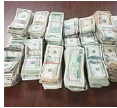
Homeowners Born Before 1985 Get A Huge Surprise FetchRate