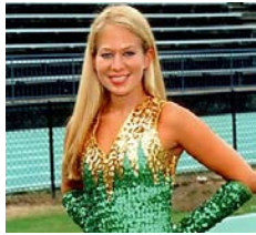
Teen Goes Missing In Aruba. But 10 Years Later, Police Uncover Direct Expose