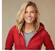
An Apple Engineer Designed a Sweatshirt That's Disrupting American Giant on Business Insider