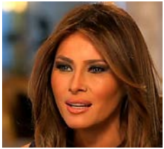
Melania Trump Can Be Better First Lady Than Michelle Obama - solopolitics.com