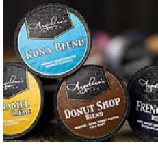
Cheap K-Cup Secrets: 3 Smart Ways to Save on Coffee Coffee Magazine