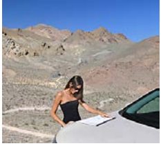
If You're An American Resident Born Between 1936 and EverQuote