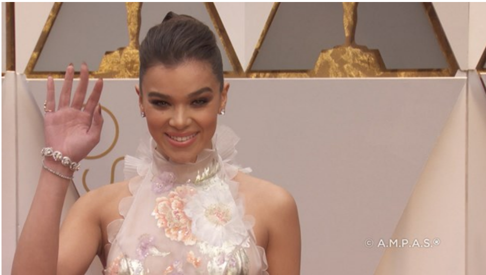
The Stars' Best Kept Secrets: Hailee Steinfeld

Adventures for People Over 50 (Fre Report)