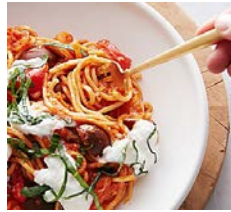
Meal Kit Skeptic? This Food Writer Was Until She Tried Plated Food & Wine