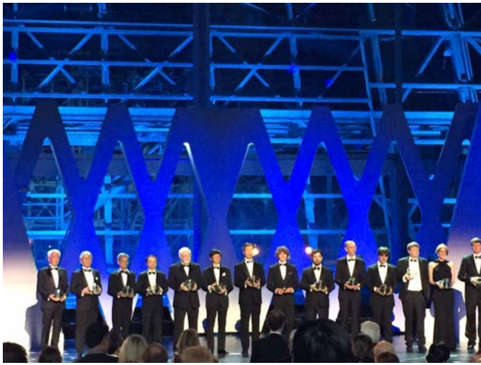
The winners of the Breakthrough Prize for life sciences, physics and math. Nov. 8, 2015 at NASA Ames Research Center

How do you make the world's best scientists into celebrities and household names? Some tech billionaires are working toward that end by holding an awards ceremony in Silicon Valley and bringing in Hollywood celebrities like Seth MacFarlane , Russell Crowe, Hilary Swank and singer Pharrell Williams . On Sunday night November 8, the Breakthrough Prize awards were held at NASA Ames Research Center.