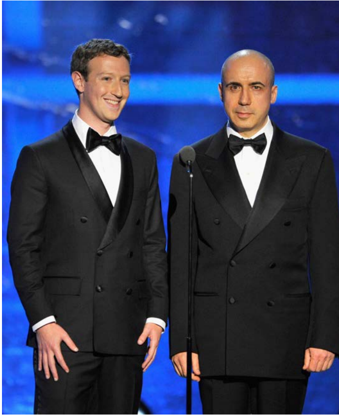
Facebook CEO Mark Zuckerberg and billionaire tech investor Yuri Milner, hosts of the 2016 Breakthrough Prize Ceremony in Silicon Valley

in a ceremony broadcast live on the National Geographic channel.