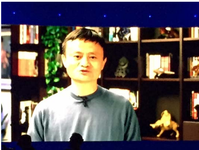
Alibaba CEO Jack Ma, one of the sponsors of the Breakthrough Prize event, sent a video message from China.

Mark Zuckerberg agrees. “By challenging conventional thinking and expanding knowledge over the long term, scientists can solve the biggest problems of our time,” Zuckerberg said in a statement. “The Breakthrough Prize honors achievements in science and math so we can encourage more pioneering research and celebrate scientists as the heroes they truly are.”