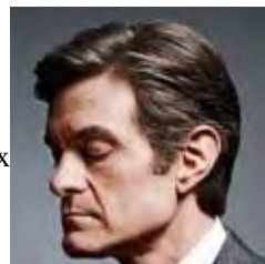
The Operator: Is the most trusted doctor in America doing more harm than good? BY MICHAEL SPECTER