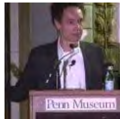
How Much Proof Do We Need? BY MALCOLM GLADWELL