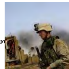
How We Forgot Iraq BY JON LEE ANDERSON