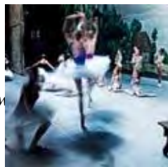
Danse Macabre: A scandal at the Bolshoi Ballet. BY DAVID REMNICK