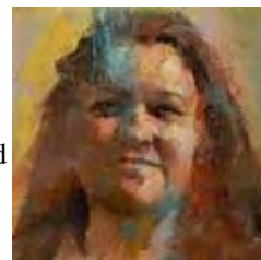
The Miner's Daughter: Gina Rinehart is Australia's richest—and most controversial—billionaire. BY WILLIAM