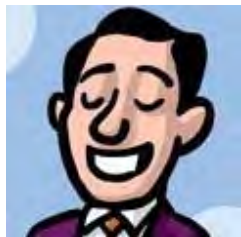
The Turnaround Trap BY JAMES SUROWIECKI