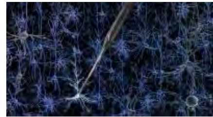
IMAGE: Researchers at MIT and the Georgia Institute of Technology have developed a way to automate a process called whole-cell patch clamping, which involves bringing a tiny hollow glass pipette in...