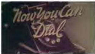
"Now You Can Dial" Teaches You