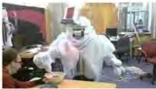
A Robot That Can Bake Chocolate-Chip Cookies