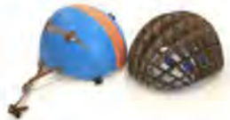
The Best Helmet You Could Own Is Made of Cardboard