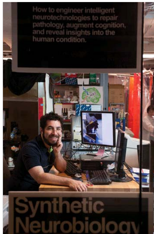
Neuroengineer Edward Boyden developed a first-of-its-kind control system for the brain.

Years of testing will be required before optogenetics can be used in humans, Boyden notes. Yet researchers in the Media Lab's new Neuroengineering and Neuromedia Group, which Boyden spearheads, are working quickly. They recently showed that the genes encoding the light-activated proteins can function safely in mammals, without triggering an immune response. They are also developing optical-fiber arrays that can beam pulses of light at specific groups of neurons deep within the brain.