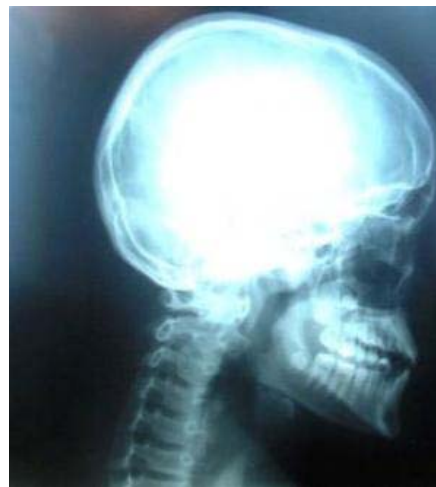
X-ray of spine and skull.