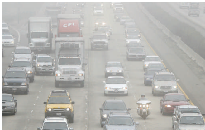
The Environmental Protection Agency now faces the task of regulating greenhouse-gas emissions from vehicles.