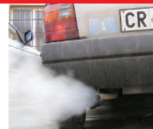
RACE FOR A GREEN CAR Multimillion-dollar X Prize set for automotive innovation. www.nature.com/news