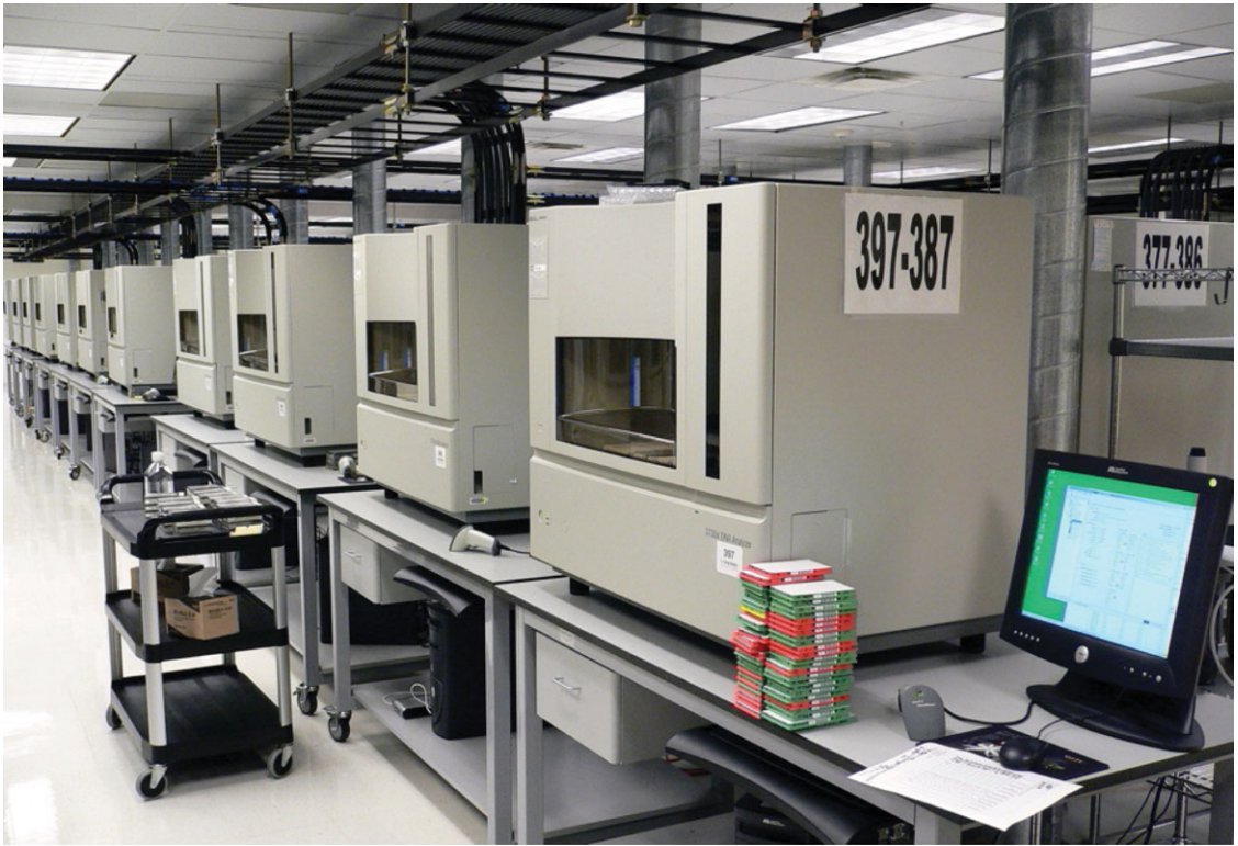
Figure 1. One of many rows of ABI 3730xl automated DNA Analyzers for shotgun sequencing of the human genome in months (30 billions bp/year) in 2005.

organisms are involved, as in in vivo neuroscience experiments. This frontier is an opportunity because automation not only makes things simpler, increasing the rate of adoption and progress of specific approaches, but also broadens the number of individuals and laboratories that can contribute innovations, since they no longer have to improve an art form, but rather can iteratively improve the protocols performed by a robotic agent. Further, higher throughput automation can enable scaling of the number of parallel samples being analyzed, or the number of analyses being performed per sample, or the sampling rate. It can also lead to increased standardization of procedures across laboratories, important for improving the ability of different parts of the literature to be integrated, and for results from different groups to be compared.